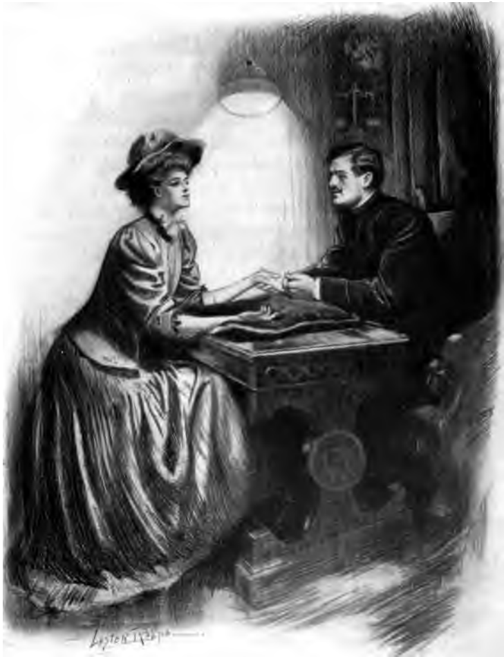
He took her hand, testing its quality and texture Page 52